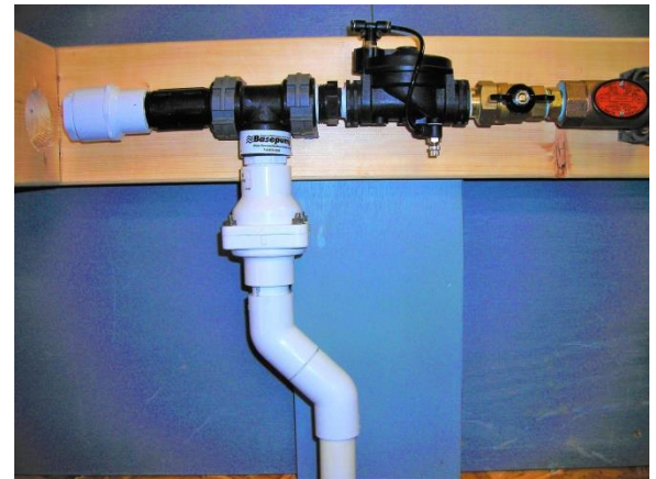
Install Suction Pipe