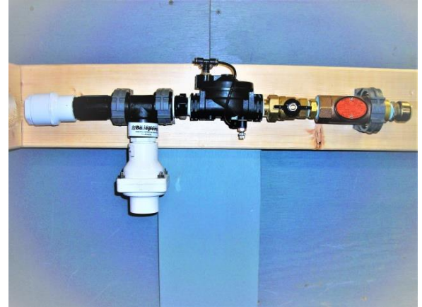
Mount Basepump Ejector