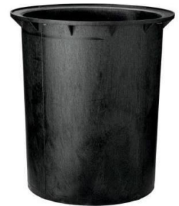
18" Diameter Sump

Sump Water Inflow: 6" Rise in 60 seconds = 400 GPH Inflow 6" Rise in 30 seconds = 800 GPH Inflow 6" Rise in 20 seconds = 1,000 GPH Inflow